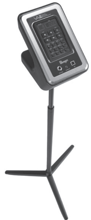
Control Panel Stand (Optional)