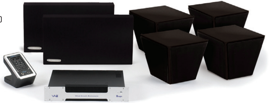
Studio VAE System